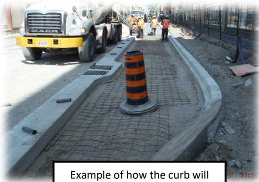
Example of how the curb will look once completed